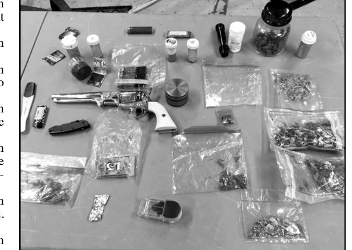
These are just some of the drugs, paraphernalia and items picked up by the Towns County Sheriff's Office during Anderson's arrest

The investigation is currently active and ongoing.