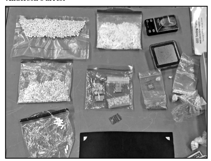
Even more drugs taken off the streets by the Towns County Sheriff's Office.